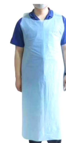
PROTECTIVE GOWN - APRON STYLE - MODEL 1D