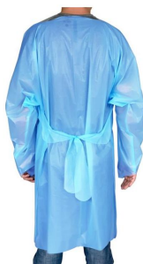
AAMI LEVEL 3 ISOLATION GOWN (PE, PARTIAL OPEN BACK, THUMB LOOP) - MODEL 1B