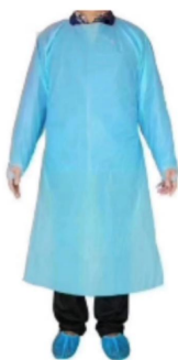
AAMI LEVEL 3 ISOLATION GOWN (PE, OPEN BACK, THUMB LOOP) - MODEL 1A