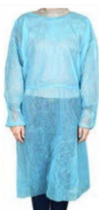
PROTECTIVE GOWN - (PP, FULL BACK COVER, ELASTIC CUFF) - MODEL 2CE