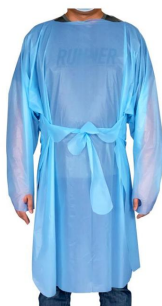
AAMI LEVEL 3 ISOLATION GOWN (PE, FULL BACK COVER, THUMB LOOP) - MODEL 1C